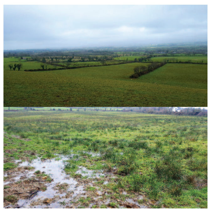
FIGURE 2: Overview of the grassland catchment and evidence of overland flow after a rainfall event on a poorly drained field where MCPA would typically be used for rush control.

Pesticide Control Division (PCD). (2013). 'Pesticide Usage in Ireland. Grassland and Fodder Crops Survey Report 2013.' Department of Agriculture, Food and the Marine.